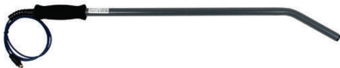
AEA580 EXTERNAL ANTENNA